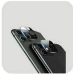
Phone lens film