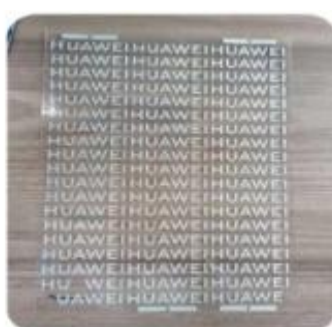
mobile phone logo