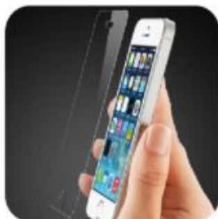
Mobile phone explosion-proof film