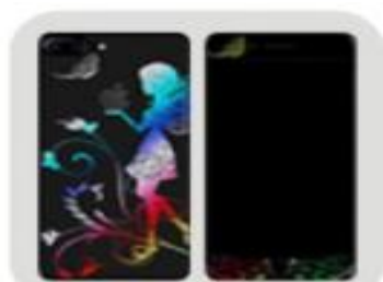
Mobile phone transfer film