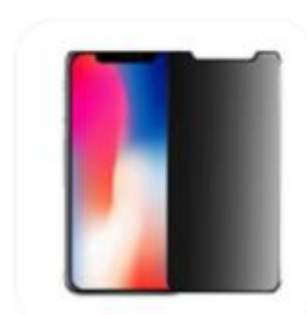
privacy screen protector for phones